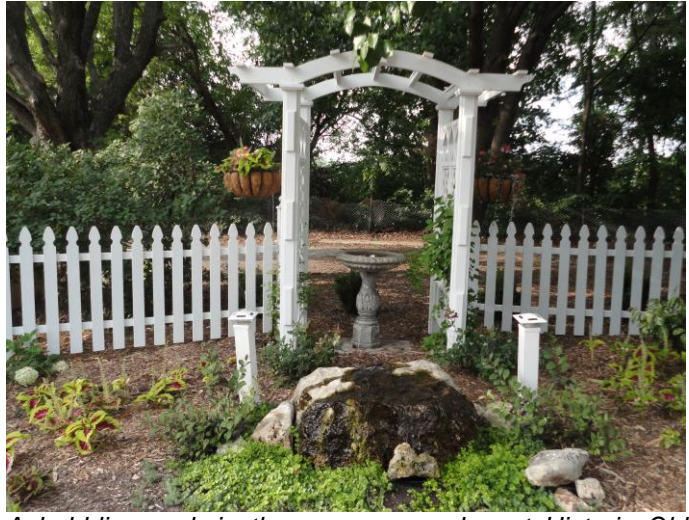
A bubbling rock in the memory garden at Historic Old Prairie Town was built by Bob Saathoff and Ray Schroeder.