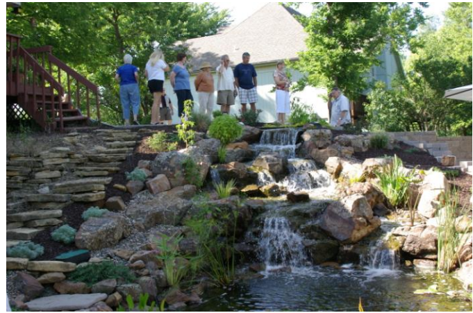
TAWGS members view the new pond at the Parkers on the recent Members Pond Tour.

5. Test oxygen levels daily and add air stones if levels fall below 7 PPM.