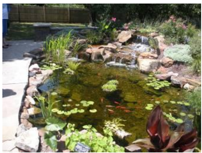
Kevin & Rhoda Han, 6200 SW 34th Terrace