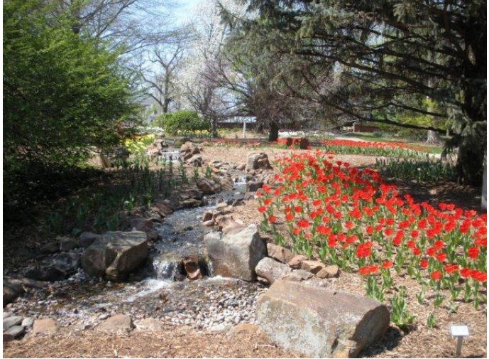
Tulips surround the new stream bed that TAWGS built at Historic Old Prairie Town last fall/this spring.

After touring the gardens, refreshments were served in the Preston Hale room.