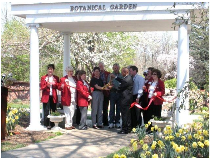
Topeka Ambassadors and city officials cut the ribbon at the Tulip Time kick off.

as a poultice to reduce swelling, the roots contain an antispasmodic, and the dried roots were chewed to relieve pain and is a anti-fungal for use against athlete's foot and diaper rash. As a tea, it is good for swollen gums, sore throat, gout, kidney stones, arthritis and some cancers. Using it in a sitz bath will help heal tearing or an episiotomy after childbirth.