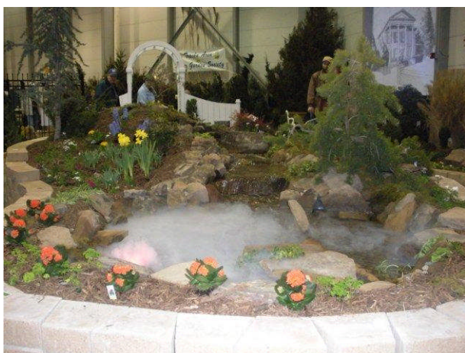
Historic Old Prairie Town was the inspiration for the 2010 Lawn and Garden Show display. Committee members did a fine job of replicating the park.