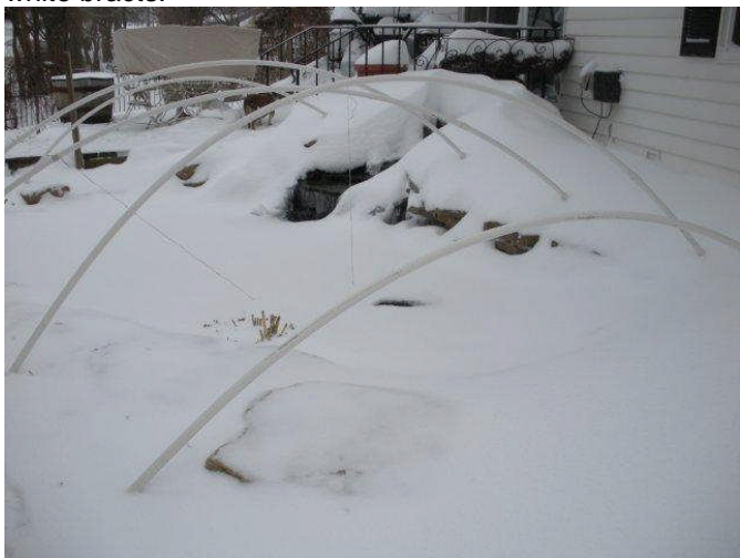
Gruver's snow covered pond in December/January.

white with yellow centers about ¾ to 1 inch across that form dense, doomed shaped clusters in July through August. The scented flowers are easily dried for dry flower arrangements or just in a vase of water. The plant prefers full sun but can handle part-shade. Zones 3- 9 is where it wants to grow. Propagation is by seeds, division in early spring or stem cuttings in spring or early summer. I did find two named cultivars. They are 'New Snow,' with short, narrow, 2 ½ inch single-veined, white-wooly leaves and 'Summer Snow,' which has brilliant white bracts.