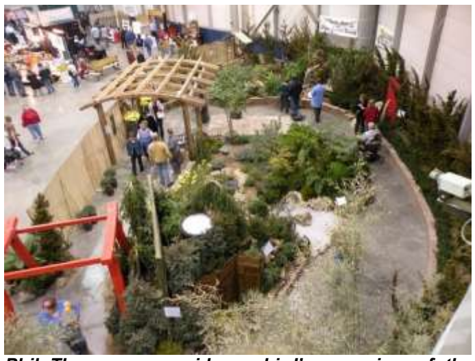
Phil Thompson provides a bird's eye view of the TAWGS and TBA Japanese Garden display at the 2009 Topeka Garden Show.