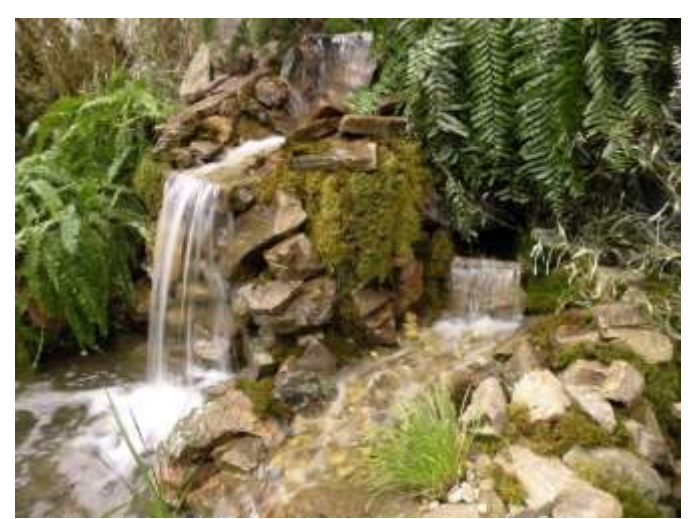
One of the water features at the Japanese Garden display.

Again, thanks to the volunteers for all their sincere hard work. I'm sure the experience will forever be a fond memory.