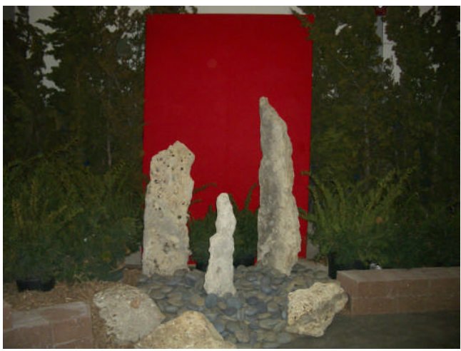
A Japaneese Garden theme was carried out at the TAWGS & TBA display at the Topeka Lawn and Garden Show.

We still need hosts for April, August, September and October. Call Duane 785-246-0240.