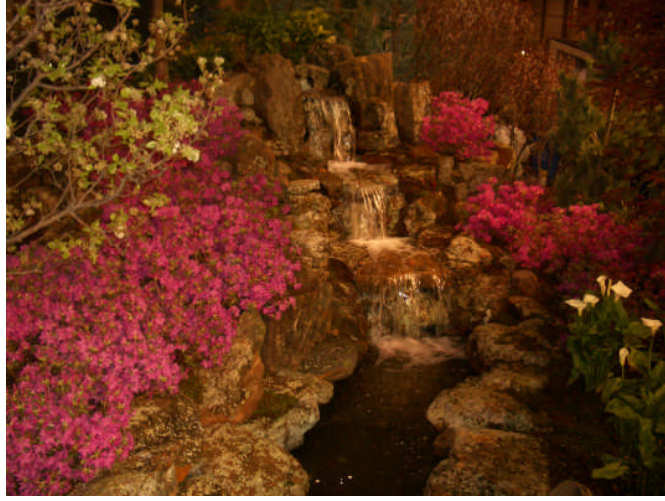
Flowers surround waterfalls in a display at the Wichita Lawn and Garden Show.