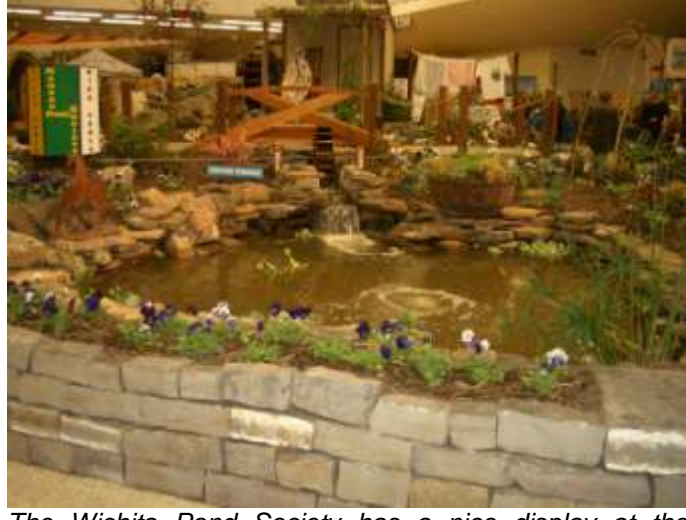
The Wichita Pond Society has a nice display at the Wichita Garden Show.