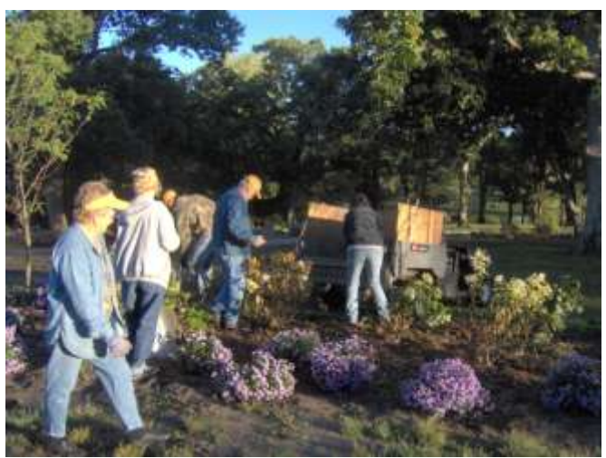
Volunteers work at the Gardens by the Lake in 2007.

water gardeners. Watch for the 2009 Wichita Garden Show schedule and make this one of your annual pilgrimages also.