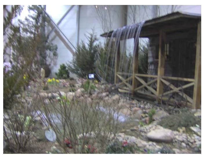
People loved to walk across or sit on the porch and look at the pond and landscape. They might have even felt a dripof water now and then.

Monthly Meeting 7:00 p.m. March 21, 2007 Historic Old Prairie Town (Ward Meade Park) Edgings around the water garden Jolene Grabill