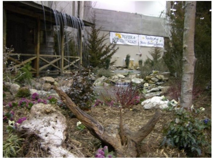
Blooming plants, huge trees, driftwood and a shed with water running off the roof into a pond were features of the display at the 2007 Topeka Lawn and Garden Show.