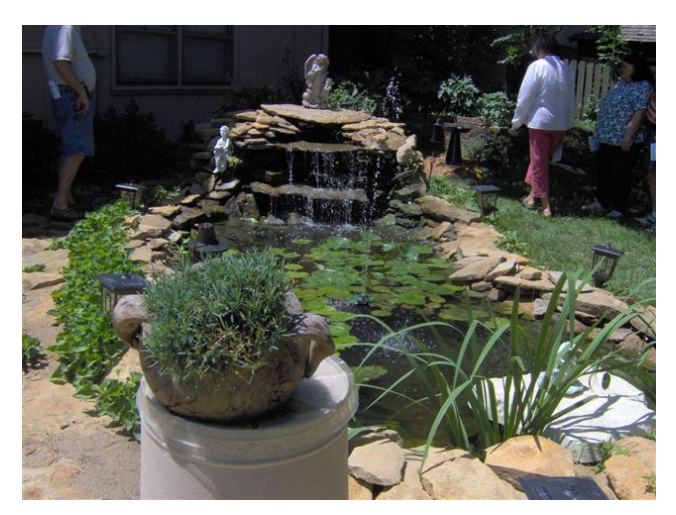
Tom and Mary Blubaugh's kidney shaped pond is surrounded by a natural stone patio.