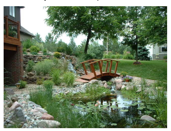
Larry and Barb Shipman's 20x24 pond has a natural 10' multiple waterfall.