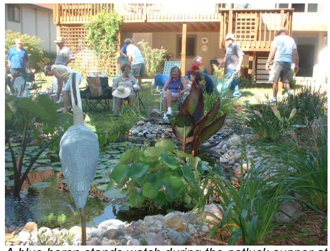
A blue heron stands watch during the potluck supper at the Taliaferro's pond.