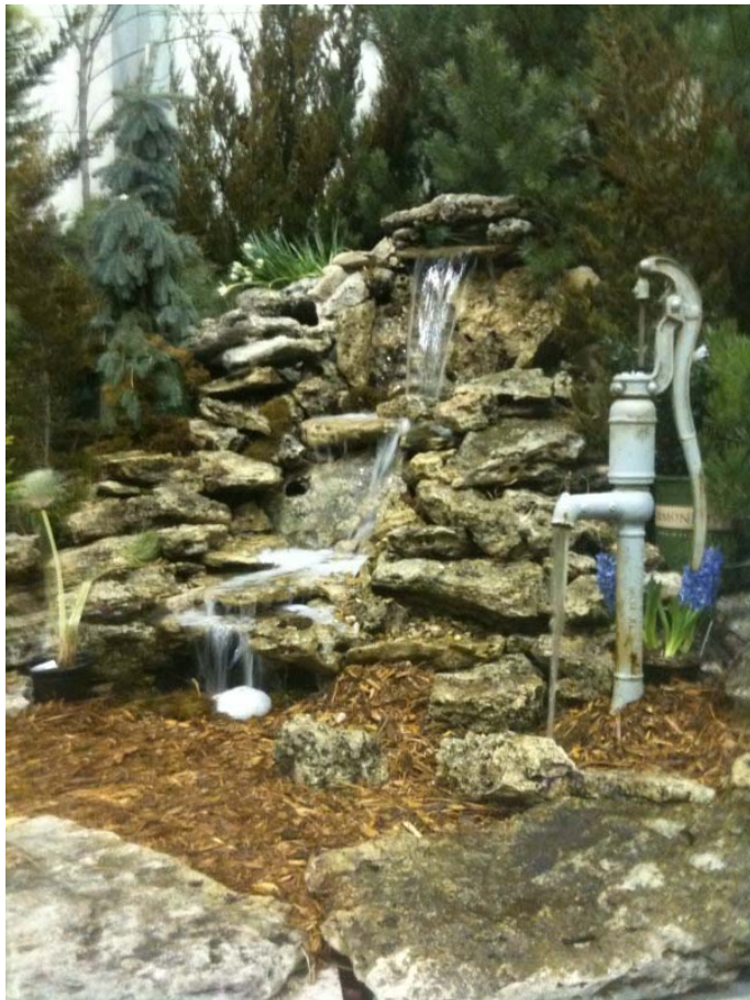
Waterfall in the TAWGS display at the Topeka Lawn and Garden Show.