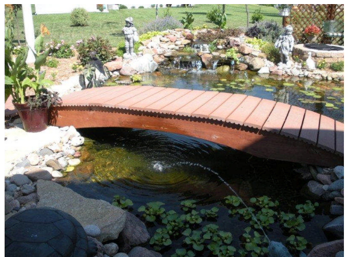
A foot bridge spans the 4,000 gallon pond at the home of Chuck and Sharon Tracy.

Go to www.tawgs.org for more great pond pictures!