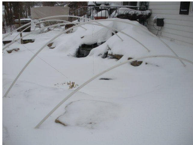
Gruver's snow covered pond in December/January.

white with yellow centers about ¾ to 1 inch across that form dense, doomed shaped clusters in July through August. The scented flowers are easily dried for dry flower arrangements or just in a vase of water. The plant prefers full sun but can handle part-shade. Zones 3- 9 is where it wants to grow. Propagation is by seeds, division in early spring or stem cuttings in spring or early summer. I did find two named cultivars. They are 'New Snow,' with short, narrow, 2 ½ inch single-veined, white-wooly leaves and 'Summer Snow,' which has brilliant white bracts.