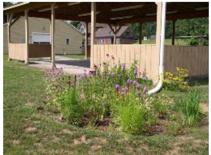
A rain garden looks much like a perennial flower bed but is designed to capture runoff water to percolate into the soil before draining into streams and lakes.

Monthly Meeting 7:00 p.m., Wed., Oct. 21, 2009 Historic Old Prairie Town To be announced