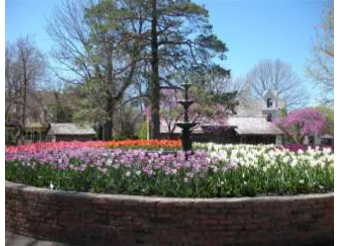
The fountain wasn't running, but the tulips were beautiful at Tulip Time at Old Prairie Town.