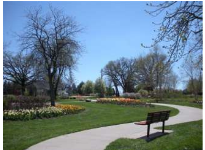
Beautiful tulips at Lake Shawnee during Tulip Time.