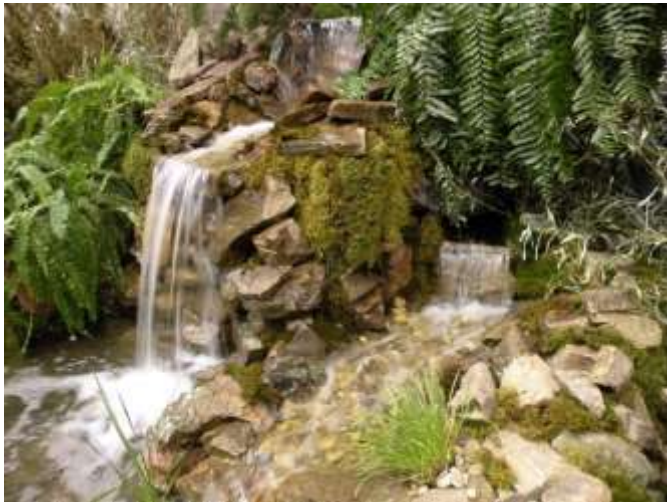
One of the water features at the Japanese Garden display.

Again, thanks to the volunteers for all their sincere hard work. I'm sure the experience will forever be a fond memory.