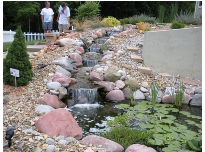
Tom Routh and Glen Caspers visit about the Casper's pond on the pond tour. A long 35 foot stream drops over seven small falls. A small bog garden at the top acts as a filter for the water.