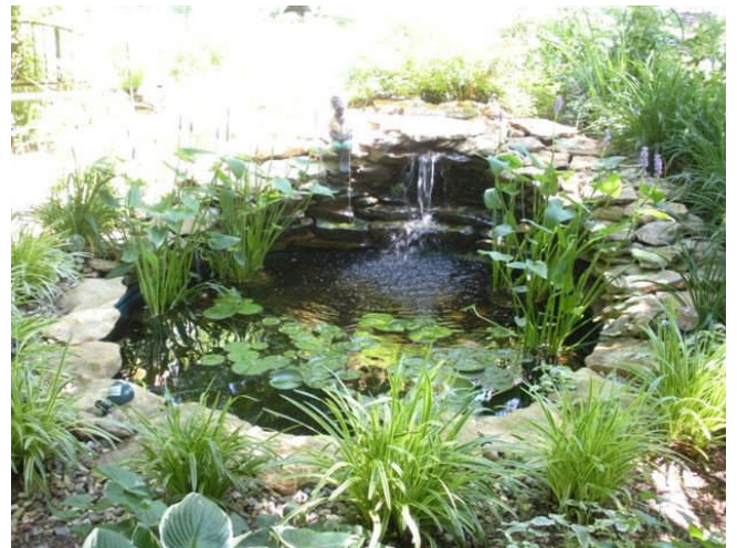
New members Ron and Theresa Webb's shaded pond is just one feature in their beautifully landscaped yard, which includes many plants, flowers and grasses.