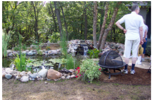
A tree separates streams in Hilderman's beautiful pond.