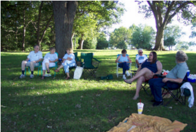
Members enjoy a potluck and visiting at Lake Shawnee following the tour.