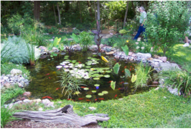
Taliaferro's pond sits near a deeply shaded woods.