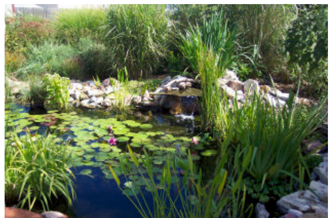
Peterman's full sun garden provides lots of beautiful blooms on their lilies.